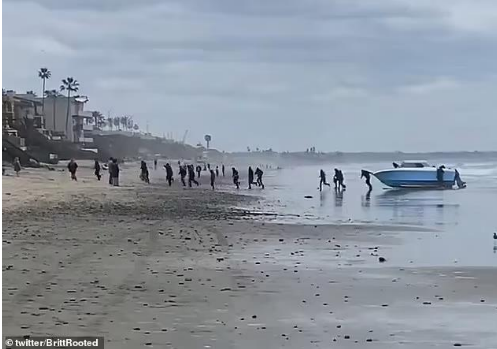
Footage of the Carlsbad boat landing: Boat Coming Ashore in Carlsbad