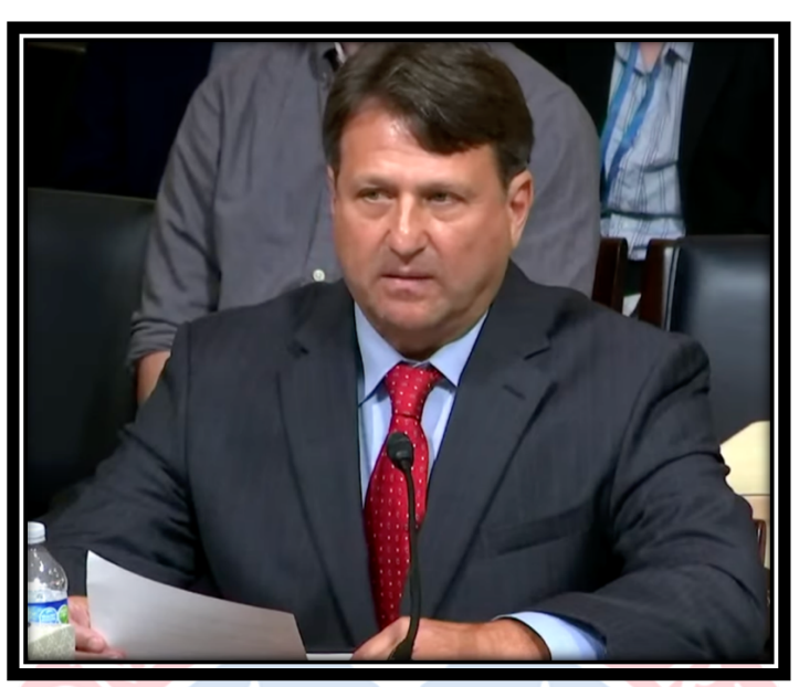
WATCH: Immigration Expert Explains How Biden Administration's Open-Borders Policies Have Led to An Influx of Children into Public School System