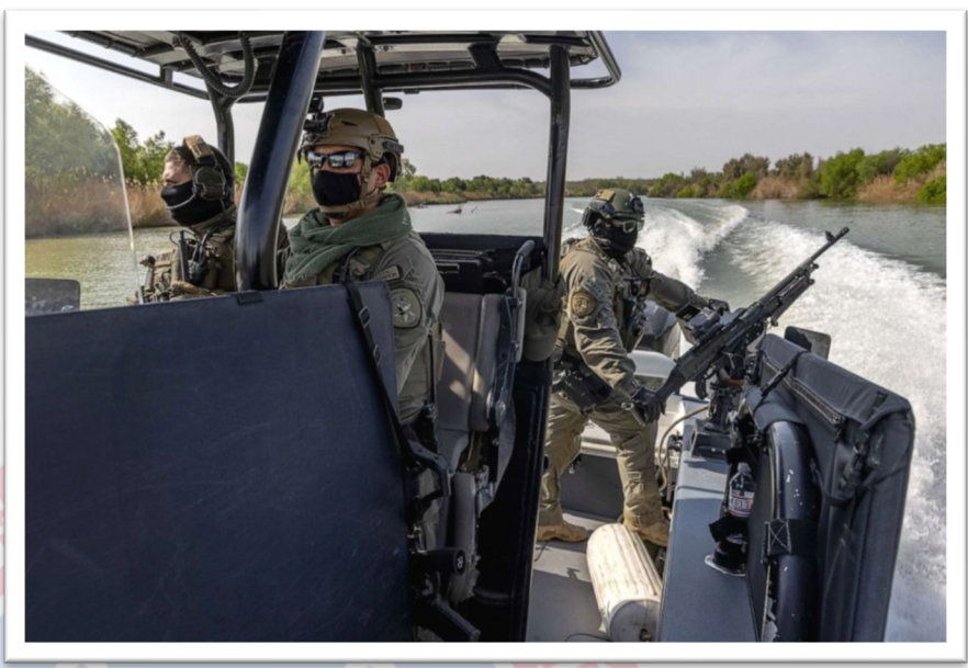
Members of the Texas Department of Public Safety's Tactical Marine Unit patrol the Rio Grande along the U.S.-Mexico border near Mission, Texas, in March 2021.

Numerous states have devoted substantial resources to respond to the crisis sparked by Mayorkas' policies, especially given the Biden administration's refusal to provide relief to these states or change its policies. These efforts have cost the states billions of dollars. States like Texas and Arizona have borne the brunt of this cost, with Texas spending the most—more than $4 billion as of November 2022.<sup>79</sup> Texas is projected to spend more than $9 billion by the end of 2024 to secure its border.80